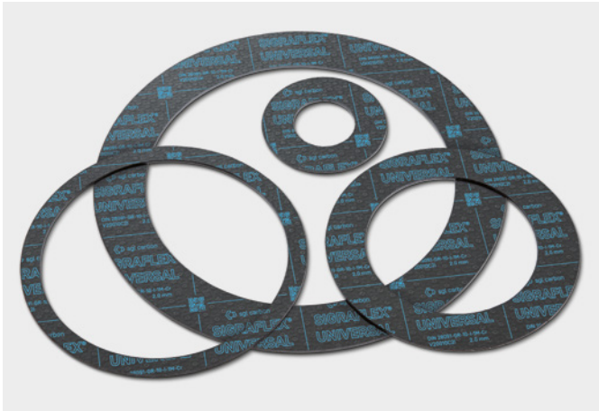
↑ Gaskets made from SIGRAFLEX UNIVERSAL